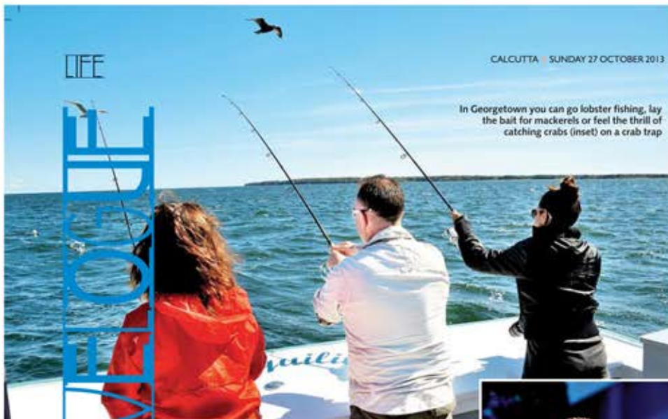
In Georgetown you can go lobster fishing, lay the bait for mackerels or feel the thrill of catching crabs (inset) on a crab trap

Saskatchewan, in the heart of Canada's prairie lands, is way off the tourist map, but offers a peek into a world of unmatched tranquility, says Rishad Saam Mehta