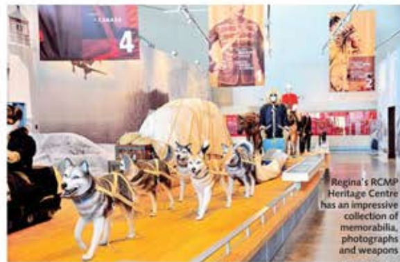
Regina's RCMP Heritage Centre has an impressive collection of memorabilia, photographs and weapons